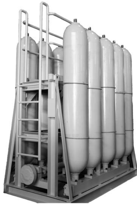
Accumulator stand with 10 sets of 230L accumulator (17MPa)