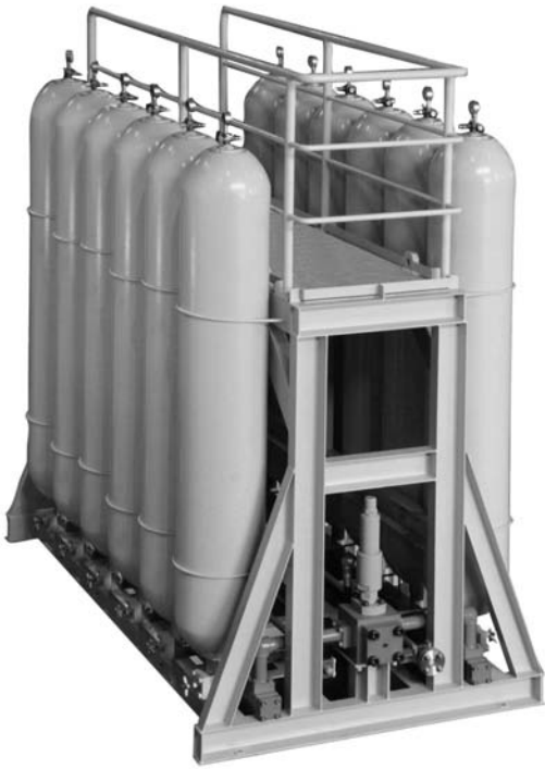
Accumulator stand with 12 sets of 220L accumulator (31MPa)