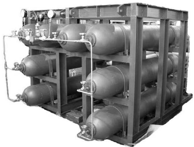
Gas cylinder stand with 8 sets of pressure vessel for N 2 gas (20MPa)