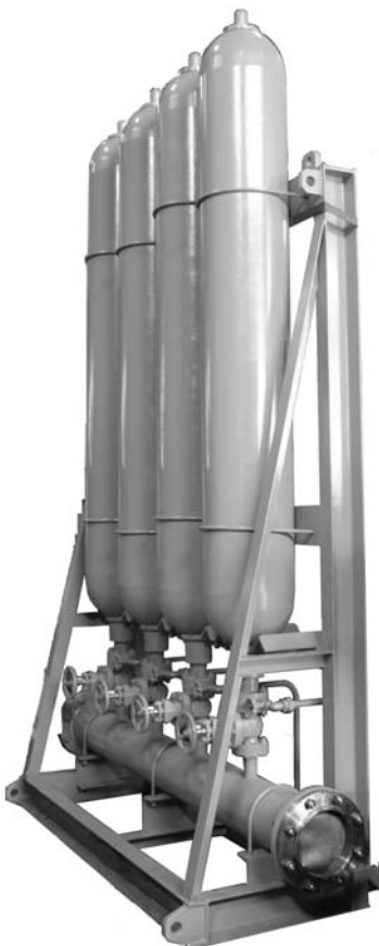
Accumulator stand with 4 sets of 120L accumulator (1MPa)